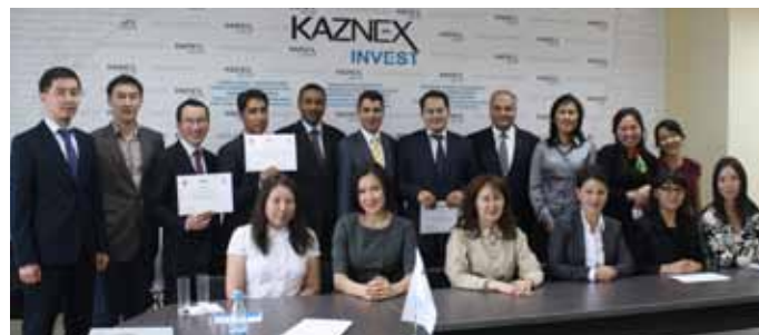
Program participants during the graduation ceremony - Kazakhstan

For the remaining part of the program, ISPAT representatives shared their experiences in promotion strategies and the way they conduct road show, also doing a presentation on ISPAT and its structure and mandate. There was also a detailed discussion on the role of ISPAT in the image building of Turkey as an investment destination, highlighting Turkey-Kazakhstan economic relationship.