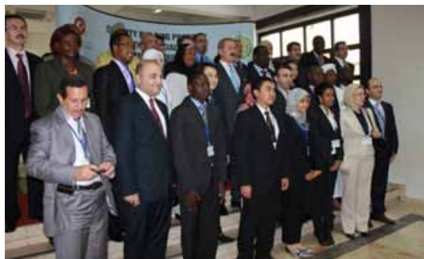
Group photo of the participants in the Program, Ankara, October 14th, 2011

ITAP, in collaboration with the Ministry of Economy of Turkey, General Directorate of Investment Incentives Implementation and Foreign Investments, the Economic Policy Research Foundation of Turkey (TEPAV), and the Union of Chambers and Commodity Exchange of Turkey (TOBB) organized a capacity building program for the officials of the Investment Promotion Agencies in the IDB Member Countries. The theme of the Program was: Turkey’s Experience Sharing Program on Investment Climate Reform. The Program took place in Ankara, Turkey on October 10 to 14, 2011 and was attended by 31 investment officials representing 29 Member Countries.