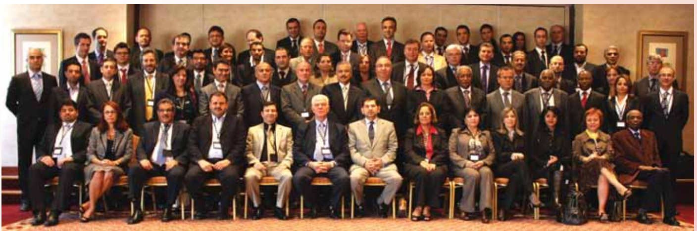
Group photo of the participants during the Second Annual Meeting of Aman Union hosted by Turk Exim Bank, 4-5 October 2011, Istanbul